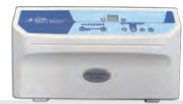
35" Elite Balance Air